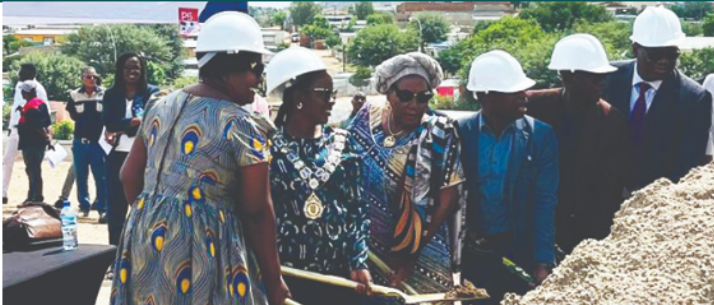
Groundbreaking ... The Informal Settlement Upgrading Affordable Housing Pilot Project launched the official start of the construction of 113 units in Goreangab Extension 4 in Windhoek